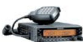
TM-V71A 2M/440 DualBand