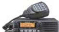
TM-281A 2 Mtr Mobile