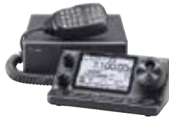
IC-7100 All Mode Transceiver