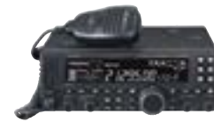
FT-450D A100W HF + 6M Transceiver