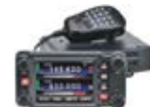
FTM-400XD 2M/440 Mobile